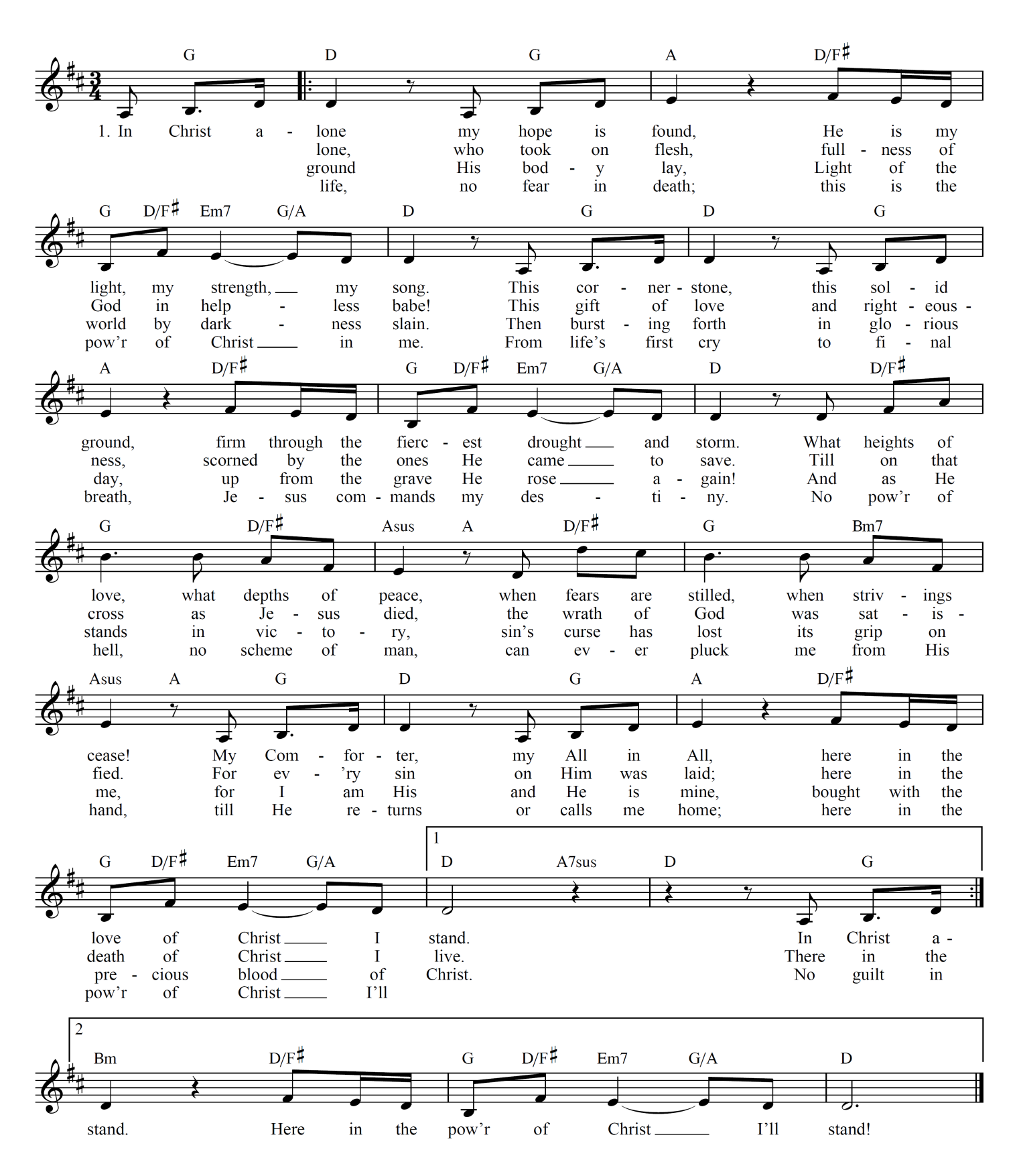
Reprinted with permission under ONE LICENSE #A-738827. All rights reserved.

Words and Music by KEITH GETTY and STUART TOWNEND